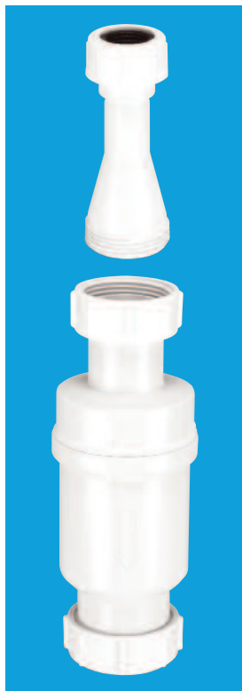
MacValve 1 1/4" BSP female inlet nut x 1 1/4" universal compression outlet including Tun Dish adaptor 1 1/4" BSP male thread x 22mm universal inlet

When MACVALVE-1 and MACVALVE-2 are installed horizontally the flow arrow must be in the uppermost position