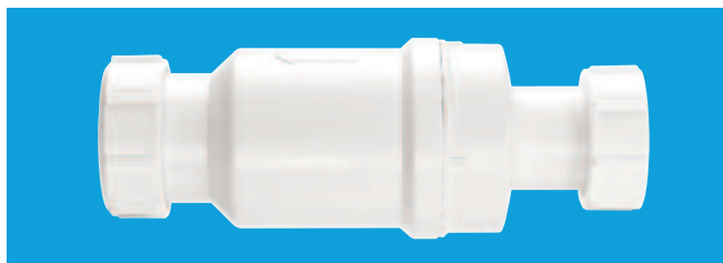
MacValve 1 1/4" BSP female inlet nut x 1 1/4" universal compression outlet