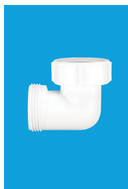
90° Bend 1 1/4" female inlet nut x 1 1/4" BSP male connector